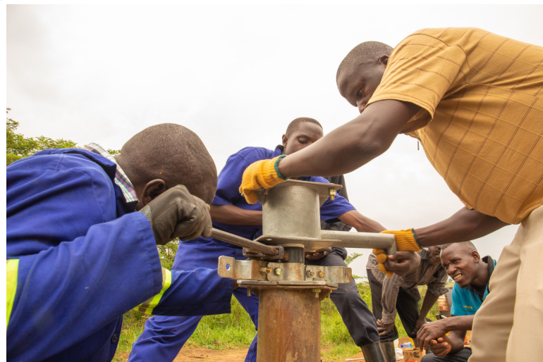
Handpump mechanics fixing a handpump head on a borehole in Bwijanga, Masindi District, Uganda,

Our goal is to create projects that address these issues , and are not only pragmatic in the current context, but also future-proofed against impending challenges. It's not just about increasing investment in water, but about fundamentally revitalising the investment landscape to incentivise measurable improvements in watershed performance.