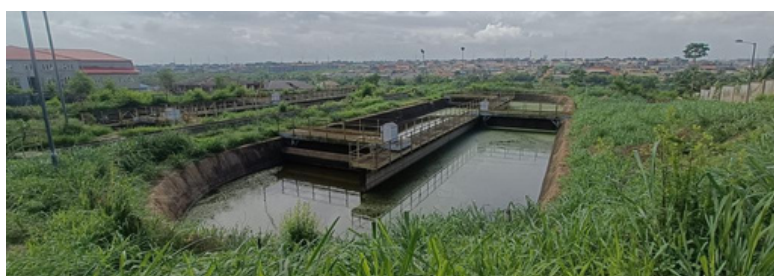
Abesan-Ipaja Septage Treatment Plant, Lagos

How do we do it? RWA focuses on strengthening market conditions for investment in water. We bring relevant decision makers, technical experts and investors together to create deal pipelines that address water risk, strengthen resilience and attract domestic or international private and public finance. We are a globally-distributed team, bringing on-the-ground expertise and comprehensive perspectives, combining climate policy, water economics, private finance, measurement and evaluation, and governance.